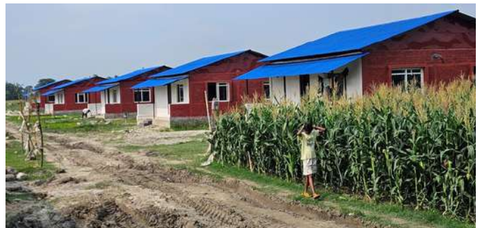
Houses for Tea Garden Laborers