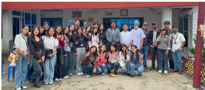
Industrial visit to Luck Dairy, Ilam, Nepal