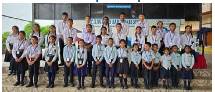
Captains for the year (2026-27)