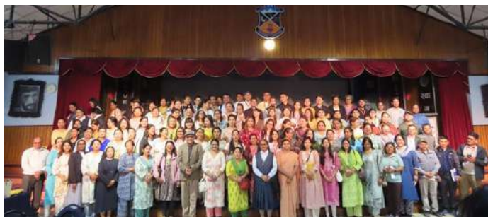
JS Teachers Workshop