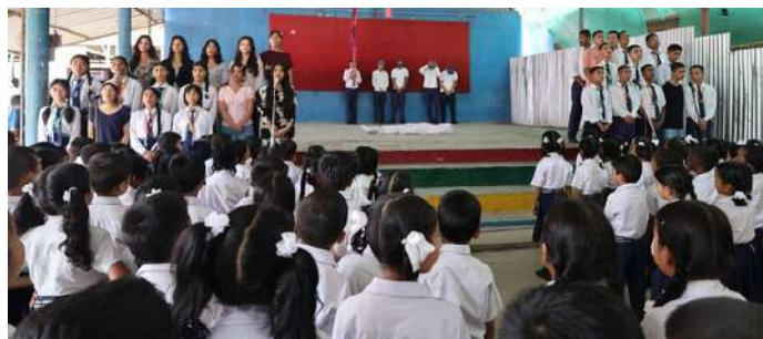
Class Assembly – Class 10