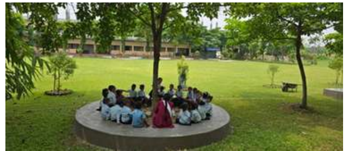
Open air class!

The new academic year unofficially commenced on 28 April with over 95% student attendance. The school formally inaugurated the academic year on 4 May with the theme, "Informed Minds, Discerning Hearts." Leadership formation programmes, orientation for new parents, badge-giving ceremonies, elocution competitions, and Staff Enrichment Programmes marked the vibrant beginning of the year. The school also celebrated a 100% SEE pass result.