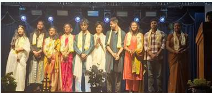
AICUF office bearers