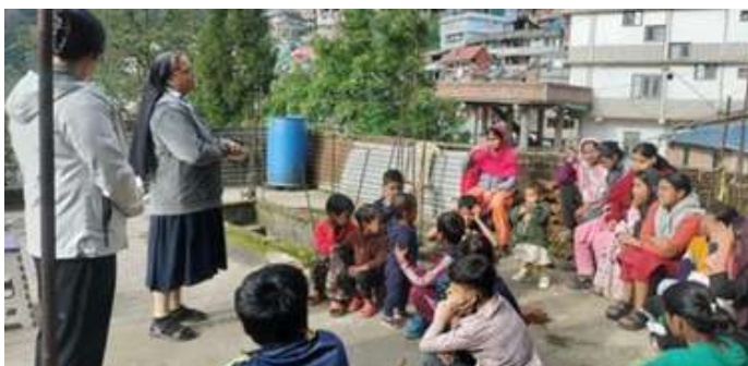
Class on Early Marriage

Additionally, an awareness programme on Domestic Violence, Child Protection, One Stop Centre services, and government welfare schemes were organized at Gasok in collaboration with the District Social Welfare Department. The programme enhanced awareness regarding legal protections, child rights, welfare entitlements, and institutional support services. Discussions during the programme also highlighted the potential need for establishing an Outreach Education Centre for children residing in the remote areas.