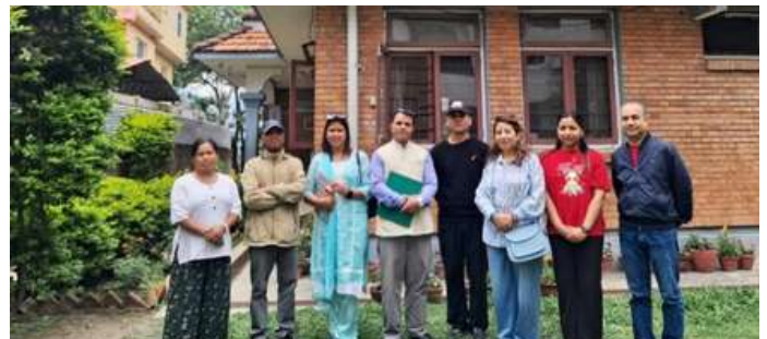
NCWC Authorities Visit

National Social Welfare Council authorities visited St. Xavier's Social Service Center, Jawalakhel, and Aruna Bhavan, Nakhipot, for field reporting. The result of Class 11 is out, and Plus 2 results are eagerly awaited. There was a family reintegration programme for four outgoing boys and girls in the presence of a representative from the Ward Office. These students have completed their class 10 and 12 while staying in the Center. They left the center with sadness but with excitement for the next chapter.