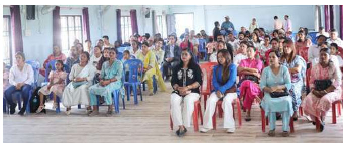
Orientation Programme for Parents

The new academic year began on the 4 th with the theme Being True Citizens. The theme is intended to elicit in everyone in the school family a desire to be responsible citizens in the wake of the country's political change. We have admitted more than 100 new students to various classes from 1 to 8. An orientation for the parents of the new students was conducted on 9 April. Since Friday is a regular class day, following the government's directives, the activity department had to rework its planned activities to align with the regular working days. 17 scouts and 2 scout masters will participate in the scout jamboree in SXG, organized to mark its 75 th anniversary. The Class 11 admission process is underway for the new batch, while the current Class 11 students are appearing for their final examinations.