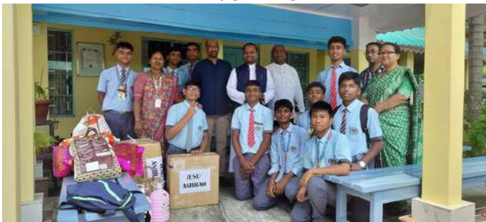
St Mary's Students, Pradhan Nagar