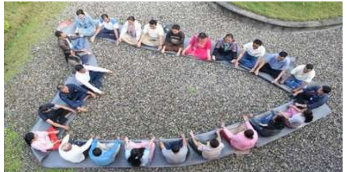
NJSI Teachers training program