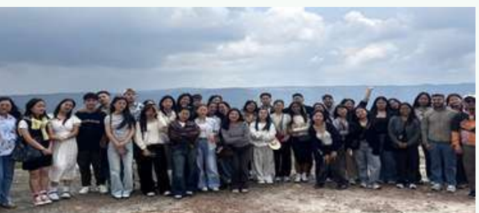
Excursion to Shilong